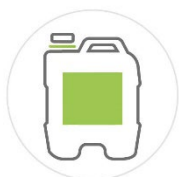
15 Kg CANISTER