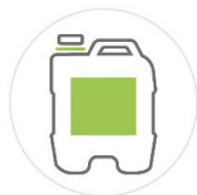
20 L CANISTER