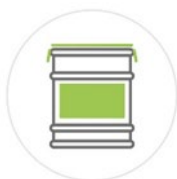
30 Kg DRUM

Please verify the packaging details, including volume and availability, with your sales representative, as they may vary depending on the production facility where the product is manufactured.