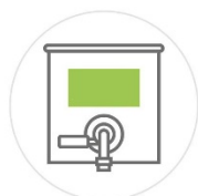
1000 Kg DRUM