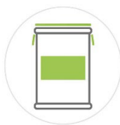
200 Kg DRUM