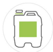
20 Kg CANISTER