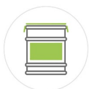
35 Kg DRUM