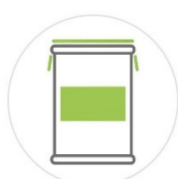
250 Kg DRUM